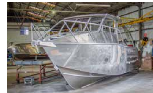
The Bandit is built tough to handle the harsh conditions of WA's southern coastline.