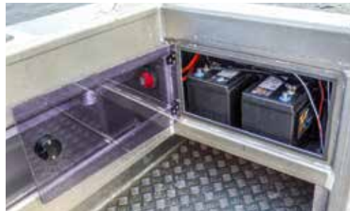
The Bandit’s workmanlike finish and layout will appeal to serious fishos.